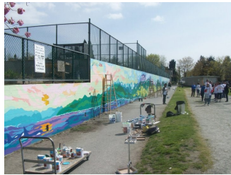
Above: One end of the 400 ft. mural Below: Students outside of the conference center with Vancouver in the background.