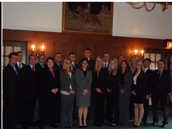
This year's and next year's officers at the transition dinner at Bloomington Country