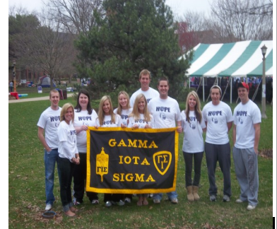
Gamma members getting ready for a night on the quad

On April 8, Illinois State University held its annual Relay For Life and this year Gamma Iota Sigma took an active stance to turn this into one of our major philanthropic events. With the partnership of Liberty Mutual, we were able to make a very generous donation and the night went really well.