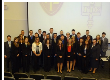
Gamma Iota Sigma members at the 2011 initiation, getting ready for a day of Gamma Games