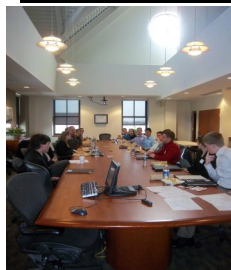
Students conversing over lunch with Liberty Mutual